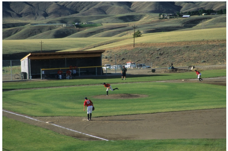
Asotin County Little League used a $147,000 Youth Athletic Facilities grant to development baseball fields, parking, and a building housing restrooms, concessions, and a small office space.