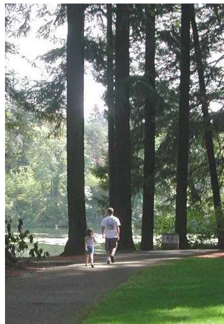
Clark County used a $122,000 grant to expand Lacamas Lake Park.

All of the board's grant processes are open and competitive. Generally, grant applications are accepted in even-numbered years. The grant proposals first are reviewed by panels of volunteers, experts, and staff. The panels weigh the