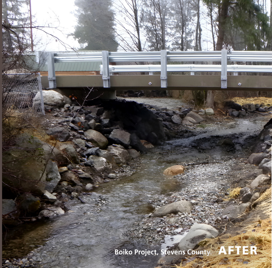
Boiko Project, Stevens County AFTER