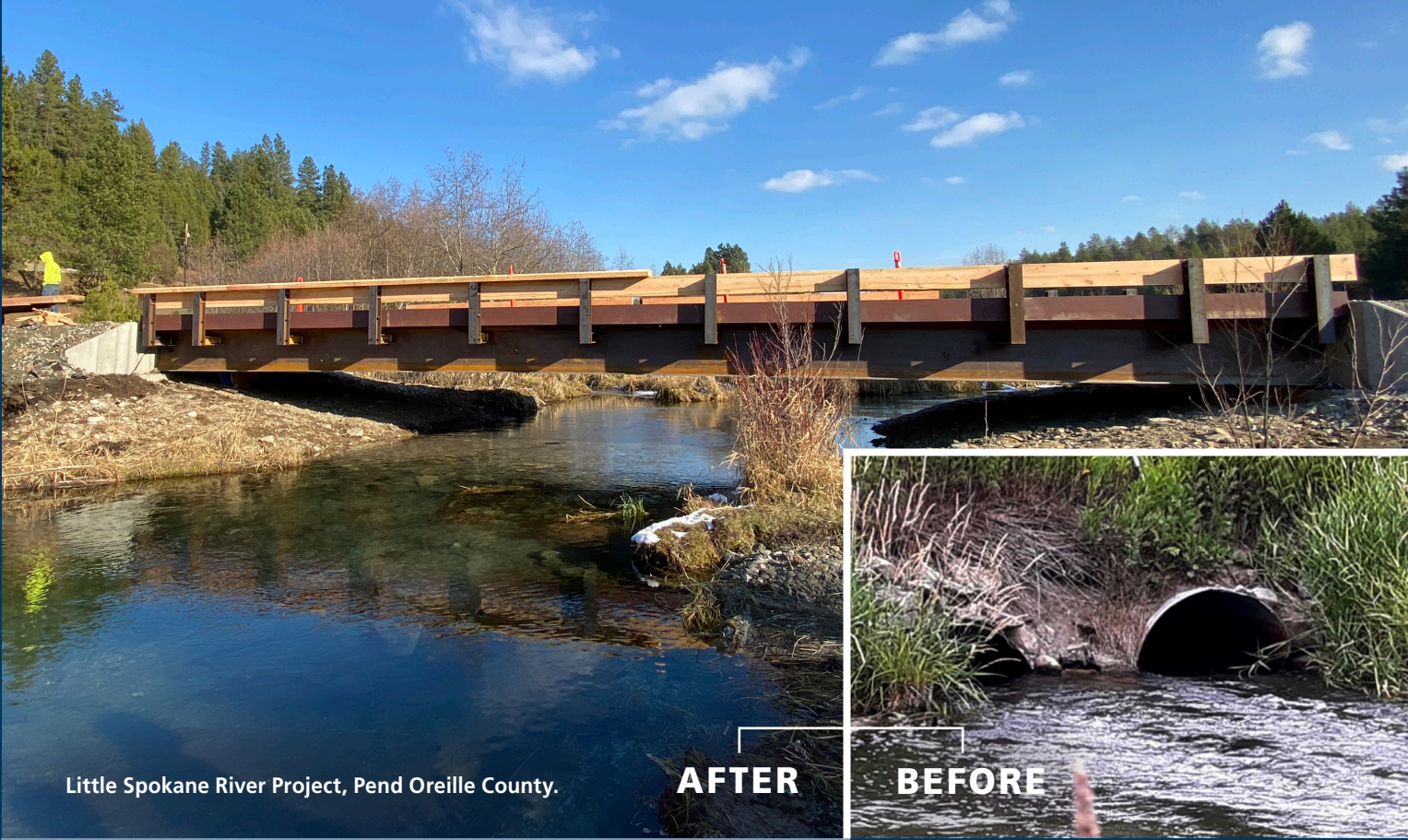
Little Spokane River Project, Pend Oreille County.